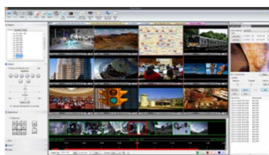
CMS Smart Search