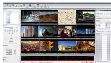
CMS Event Search